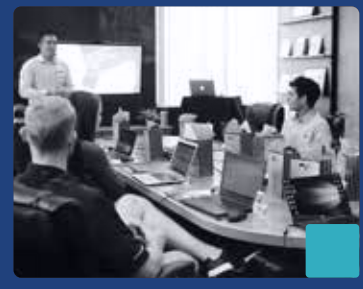
Consulting & Professional Services